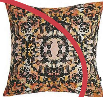
CUSHION Amy Sia 'Sahara' cushion cover, $109, Hard To Find.