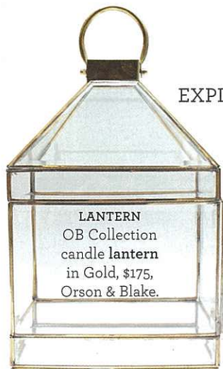
LANTERN OB Collection candle lantern in Gold, $175, Orson & Blake.