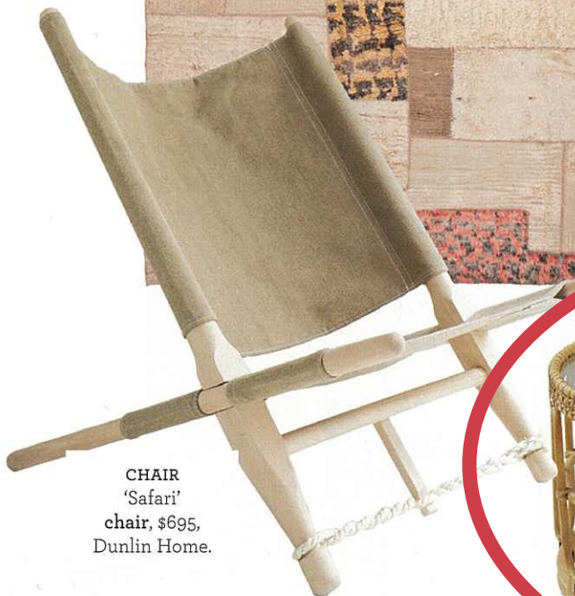
CHAIR 'Safari' chair, $695, Dunlin Home.