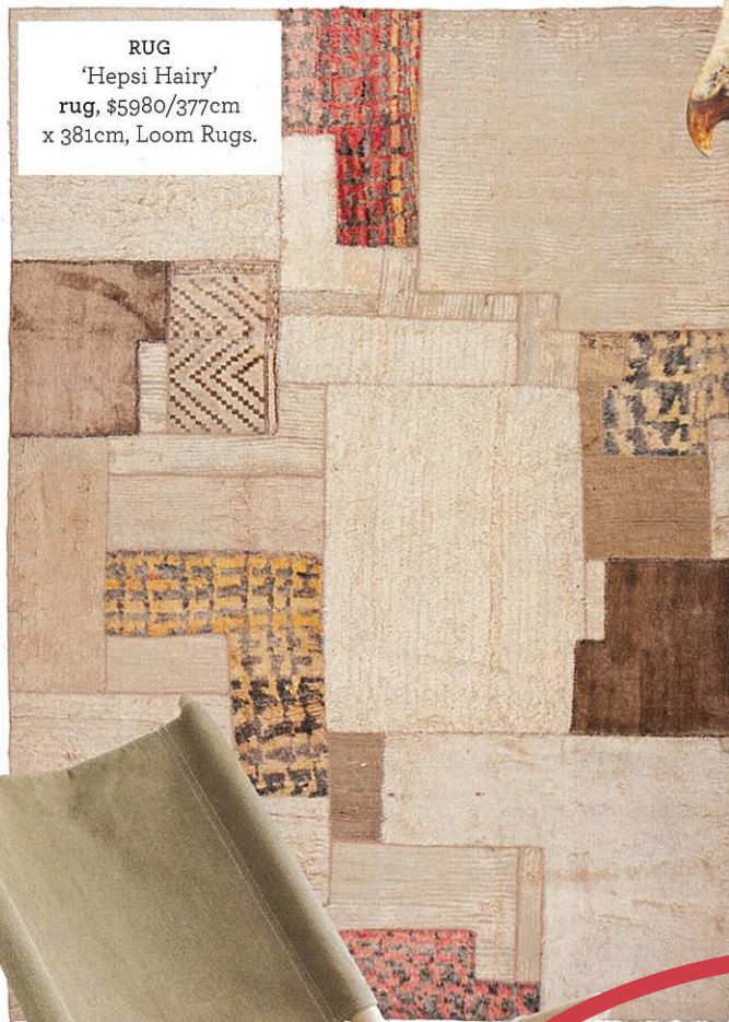
RUG 'Hepsi Hairy' rug, $5980/377cm x 381cm, Loom Rugs.