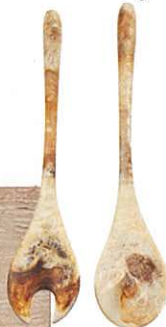
SERVERS Long 'Resin Dew' servers in Light Horn, $105, Dinosaur Designs.