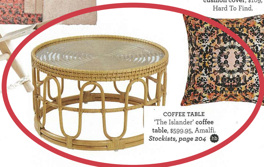
COFFEE TABLE 'The Islander' coffee table, $599.95, Amalfi. Stockists, page 204 hb