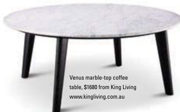
Venus marble-top coffee table, $1680 from King Living www.kingliving.com.au