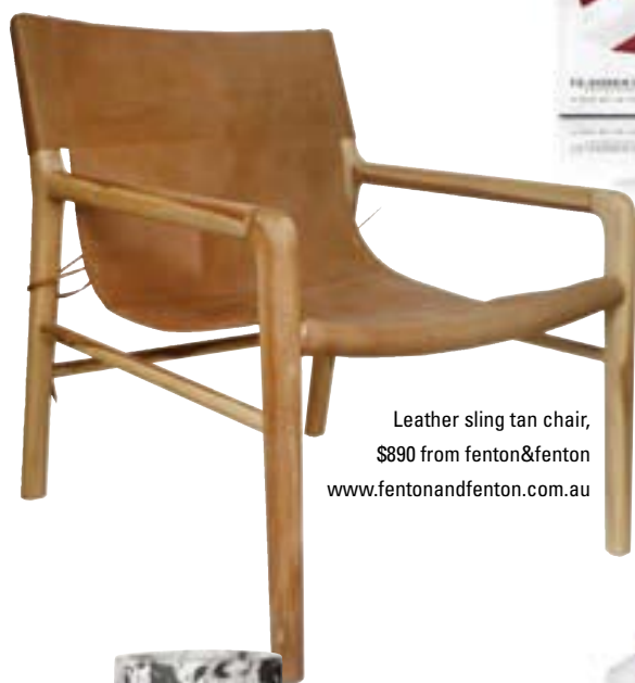
Leather sling tan chair, $890 from fenton&fenton www.fentonandfenton.com.au