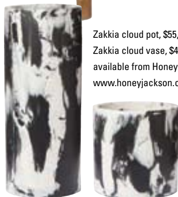
Zakkia cloud pot, $55, and Zakkia cloud vase, $49, available from Honey Jackson www.honeyjackson.com.au