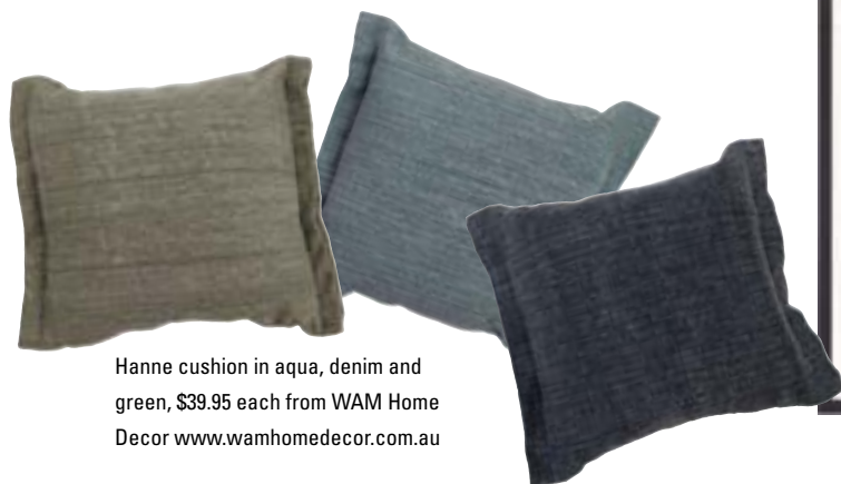
Hanne cushion in aqua, denim and green, $39.95 each from WAM Home Decor www.wamhomedecor.com.au

WE HIT THE SHOPS TO SEARCH OUT THE BEST AND BRIGHTEST TO HELP YOUR HOME LOOK THE PART THIS WINTER.