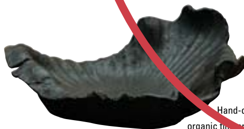
Hand-carved organic timber bowl, $198 from Satara www.satara.com.au