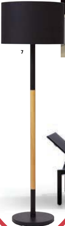
1. Shaynna Blaze for Urban Road Fleeting Moments artwork in Smudge, from $120, Urban Road. 2. Husk pendant light, $169, Beacon Lighting. 3. Gus Halifax chair, $1595, Globe West. 4. Basic rectangular 100 per cent marble tray, $135, Marble Basics. 5. Gloster Grid sofa, POA, Cosh Living, www.coshliving.com.au . 6. Tribù Illum collection lounge, POA, Cosh Living, www.coshliving.com.au . 7. Abby floor lamp, $269.95, Amalfi. 8. Paramount sculpture, $12.95, Emporium.