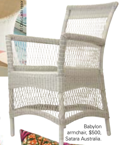
Babylon armchair, $500, Satara Australia.