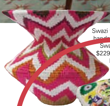
Swazi vessel, handwoven in Swaziland, $229, Safari Fusion.

El Oro Lado resort, Panama. A member of Design Hotels. www.designhotels.com .