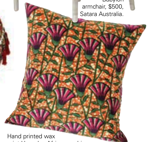
Hand printed wax print Ugandan African cushion in purple, from $29, Vinyl Cuts.