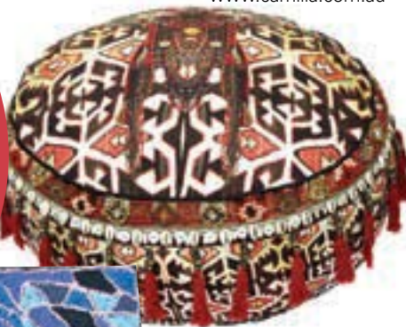
Camilla small ottoman, www.camilla.com.au