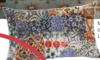
Marrakesh cushion, POA, Linen & Moore.