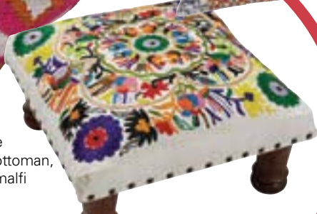
Lyon square footstool / ottoman, $139.95, Amalfi